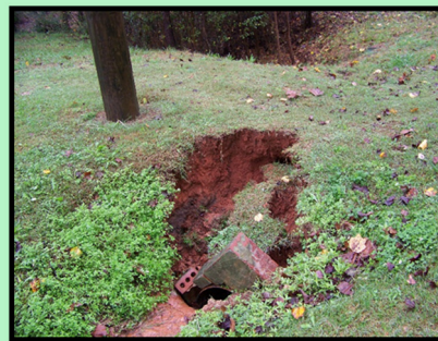
Saddlecreek Rd ← Before → After

The City of Auburn's Public Works Department and Stormwater have been exceptionally busy with Stormwater Capital Improvement Projects. Washed out drainage culverts at Lakeview Drive and Saddlecreek Road had failing public drainage components (pipes and structures). As a result, additional new structures were added within the public right of ways.