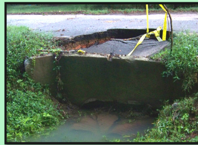
Lakeview Dr ← Before → After